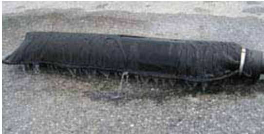
EVAC Filtration System filtering water.